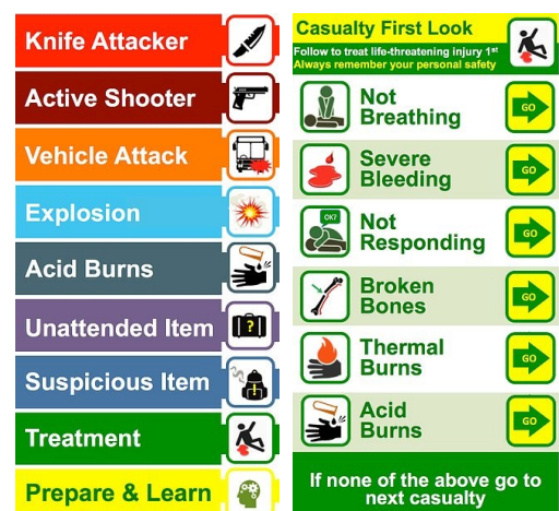
The citizenAID app